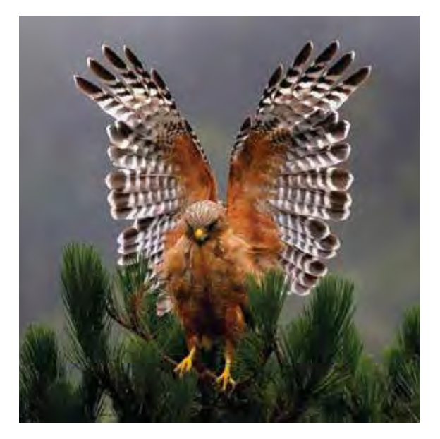
Red-shouldered hawks are frequently seen throughout Wunderlich Park.

When you're done with your tour, please return this guide to the kiosk for the next visitor. If you find this guide, please return it to: Wunderlich Park, 4040 Woodside Road, Woodside, CA, 94062.