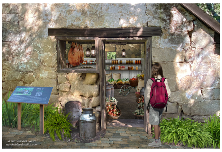
Renderings of post restoration exterior and interior view of the Dairy House at Wunderlich Park by Steve Hubbard