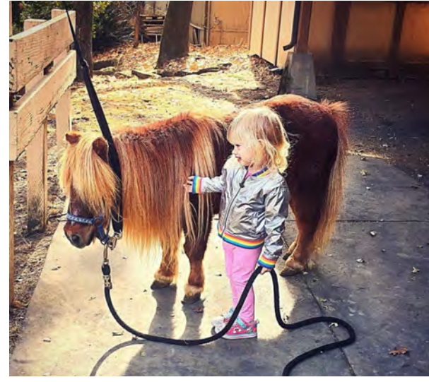
Lightning enjoying time with three-year-old Bow

With the advent of COVID-19, Chaparral experienced financial hardship and was faced with the possibility of having to sell Lightning. The Friends stepped in to "adopt" Lightning and help take care of the costs of his care. In addition, a cadre of docents are responsible for his grooming and exercise. Look out for Lightning the next time