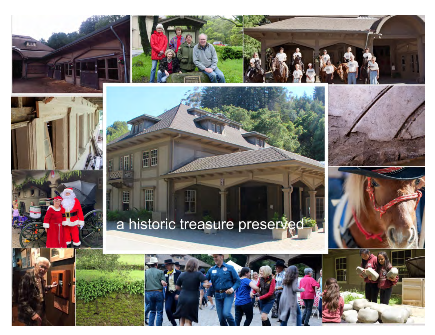
Stable evolution, from top left, clockwise. The stable at its nadir; restoration visionaries; the restoration committee; historical construction revealed during restoration; therapy minihorse greets visitors; students build stone walls during history field trip; biannual Big Bad Barn Dance; original hand-built stone walls; Carriage Room Museum; the Clauses at biannual Holidays with the Friends; the stable during reconstruction.

We deeply appreciate the commitment of so many donors, volunteers, and advocates who have made this a truly special place, enjoyed by thousands of people.