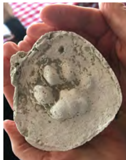
Plaster cast of a mountain lion track.