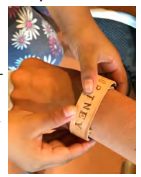
Children in the LifeMoves program helped each other with leather crafting during their visit.

The Big Lift, a county program aiming to transform early learning in communities with below-average reading scores, bused children to Huddart for a summer day to learn about nature and to hike the trails with docents.