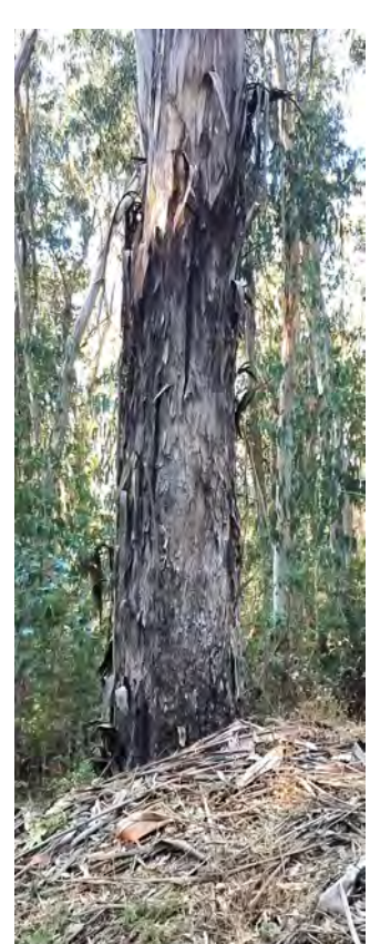
A shaggy eucalyptus, one example of the invasive trees displacing native habitat in Wunderlich.

Since 2006, this project has been in the Wunderlich and Huddart Parks Master Plan but was not implemented due to lack of funding. Three years ago, PG&E partnered with San Mateo County Parks to identify tree mitigation opportunities for PG&E's nearby Natural Gas Line 109 Replacement Project,