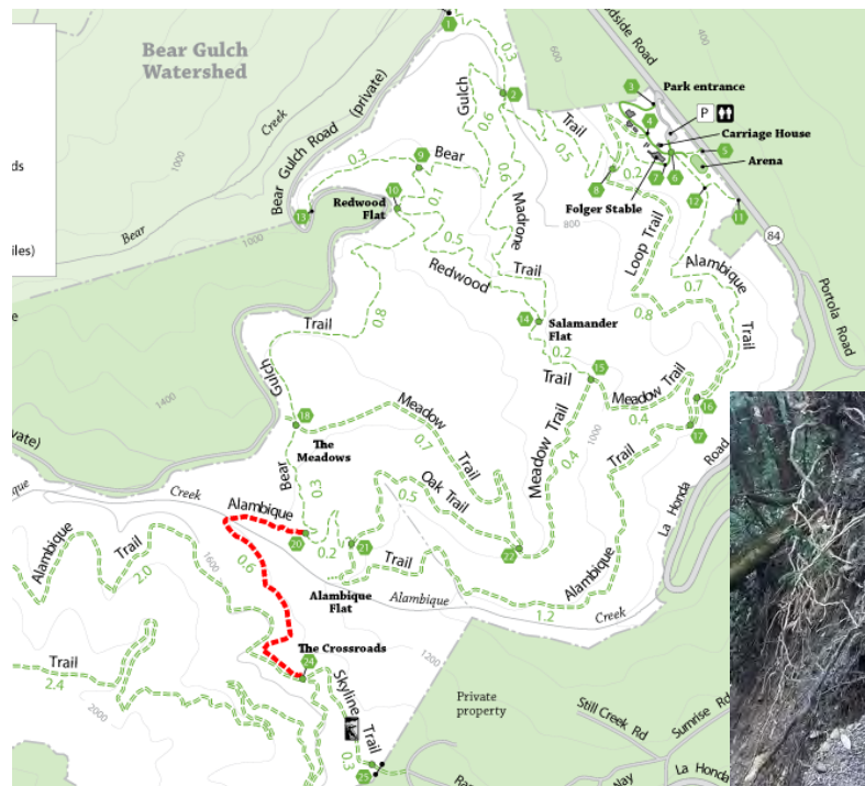
The red line on the map of Wunderlich Park shows where the trail closure is between the Bear Gulch Trail junction and the Skyline Trail. The photo inset shows how the Alambique Trail has collapsed down a ravine, making the route impassible for both hikers and equestrians.