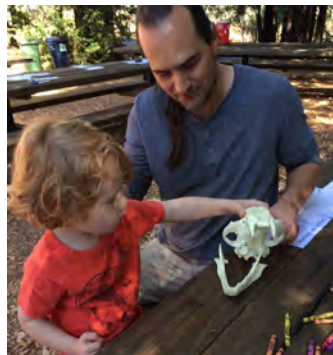
Visitors examine a mountain lion skull at an activity table.

The Friends cohosted the third annual Family Nature Day with Peninsula Open Space Trust (POST) and San Mateo County Parks in September. Docents led families on nature hikes and showed bird nests, animals skulls, and pelts as well as offered kid-centered activities. The Friends were able to upgrade the activity centers this year thanks to Measure K Funding from the San Mateo County Board of Supervisors.