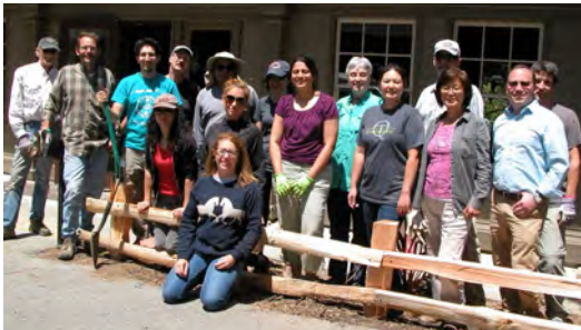
Scientists from Merck Research Labs pause by a piece of the extensive fence they spent the day building in Wunderlich.

On a beautiful June day, eighteen employees from Merck Research Labs in Palo Alto returned to what is now their annual Give A Work Day to support the Friends and the San Mateo County Parks. As part of a team-building experience and a company effort to donate service to the community, they spent a day replacing a 15-year old wooden fence. The manual labor entailed digging out the old posts and full fence running along the Carriage House, replacing it with new, deeper post holes and a two-tiered cross-rung fence. The fence protects visitors and equestrians as well as aesthetically maintains the area. It is worth a visit to Wunderlich to see the handiwork of what a few inexperienced and mostly first-time fence builders can do in a single day. For inquiries about a service day in Huddart or Wunderlich for your company, call 650-851-2660.