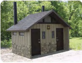
Example of the modern restroom that will replace the Port-a-Potty currently the sole public facility at Wunderlich Park.

Remember last year's Carts to Cars fundraising event hosted by the Friends? It inspired terrific support for two parks projects: the installation of an ADA restroom and upgrade of the picnic area at Wunderlich, and the installation of a new playground at Huddart. Here's the status of those projects: In Wunderlich the plan is to install the bathroom sometime this fall pending an official bid from the